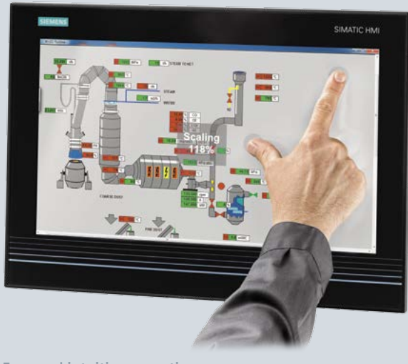
Easy and intuitive operation via multitouch gestures