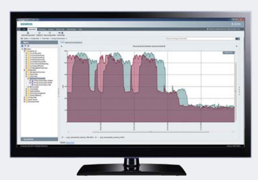
SIMATIC B.Data: Increased production transparency