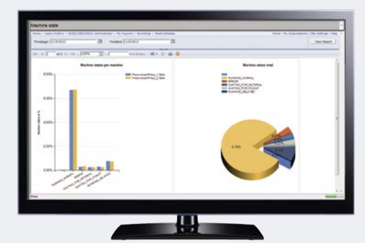
SIMATIC Information Server: Comfortable analysis and report generation