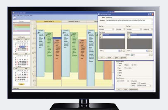
WinCC/CalendarScheduler: Planning of calendar-based events